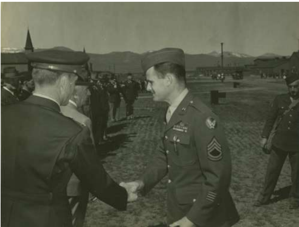
Better photo of the Air Medal being awarded