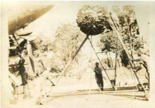
Dad replacing an engine (He is far right pushing the stand)

The time that he spoke with me about being shot down was scary enough. Flying over the Himalayas with a cargo of airplane fuel in fifty-five gallon drums his plane was strafed by a Japanese fighter plane. The drums and wings were hit. Dad was waist deep in airplane fuel and had to punch holes in the belly of the plane to drain the leaking fuel which luckily had not exploded.