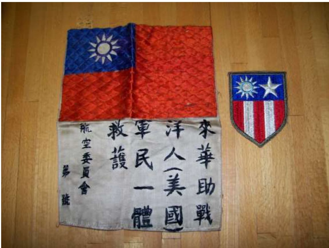
Flag of the Republic of China with instructions below and patch worn on uniform

Dad had a broken leg and had been rescued by Chinese peasants and taken to their village. Why did they rescue him? He wore special patches on his flight jacket and carried a cloth with instructions written in Chinese. The rest of the crew was never mentioned; they also carried the same cloths and wore the same patches. I still possess the patches and cloth.