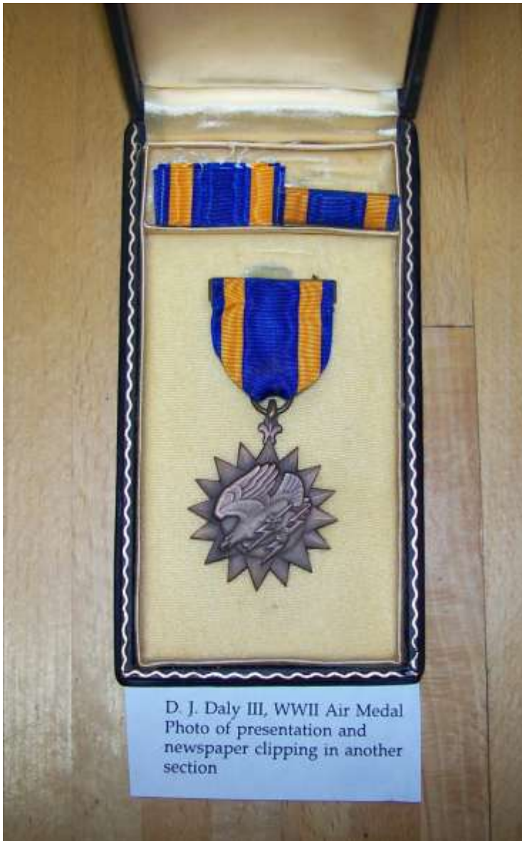
D. J. Daly III, WWII Air Medal Photo of presentation and newspaper clipping in another section